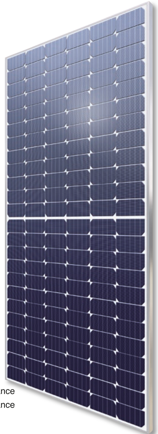
Fig. similar 144MHUSA210203A

High quality junction box and connector systems