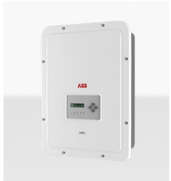
ABB string inverters UNO-DM-1.2/2.0/3.0-TL-PLUS 1.2 to 3.0 kW